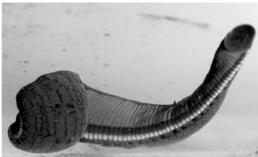
Sartor C, et al. Lancet 2013;381:1686