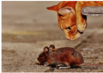
Cats for pest control.