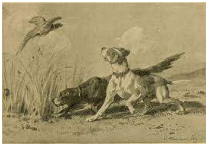
Dogs helping bird hunter.