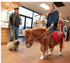
Miniature service horse. (The Guide Horse Foundation)