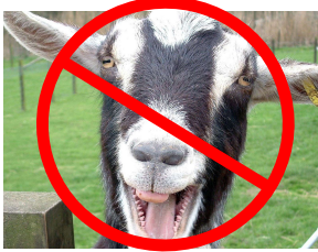
"Smiling" goat. (WallpaperUse)