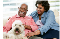
People with their pet. (CDC)