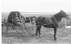
People using a horse and buggy.