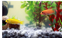
Fish in a fish tank.