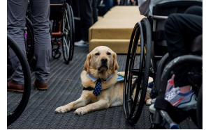
Service dog.

*Exception for miniature horses that are housebroken and do not create safety issues