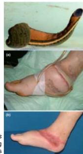
Leech and Aeromonas hydrophila infection following use of medicinal leeches