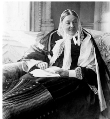
Florence Nightingale Wellcome.

Nightingale, Florence. 1859. Notes on Nursing: What It Is, and What It Is Not.